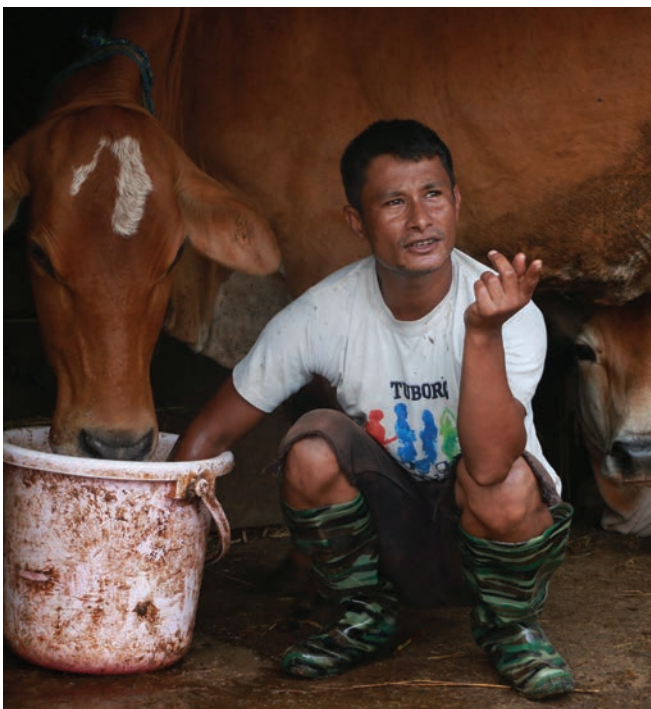
Preparing feed for cattle, Morang District

✓ RECOMMENDATION: Nepali M4P programmes should take time to develop sound partnerships and be prepared to spend more resources in developing their partners' capacity. They should continually seek to identify and partner with other market system players to avoid market distortion, and should consider opportunities to collaborate with other programmes and to offer time and resources to meet shared objectives.