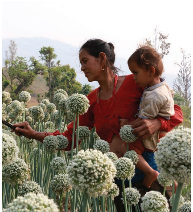
Checking onion seeds for pests, Dailekh District