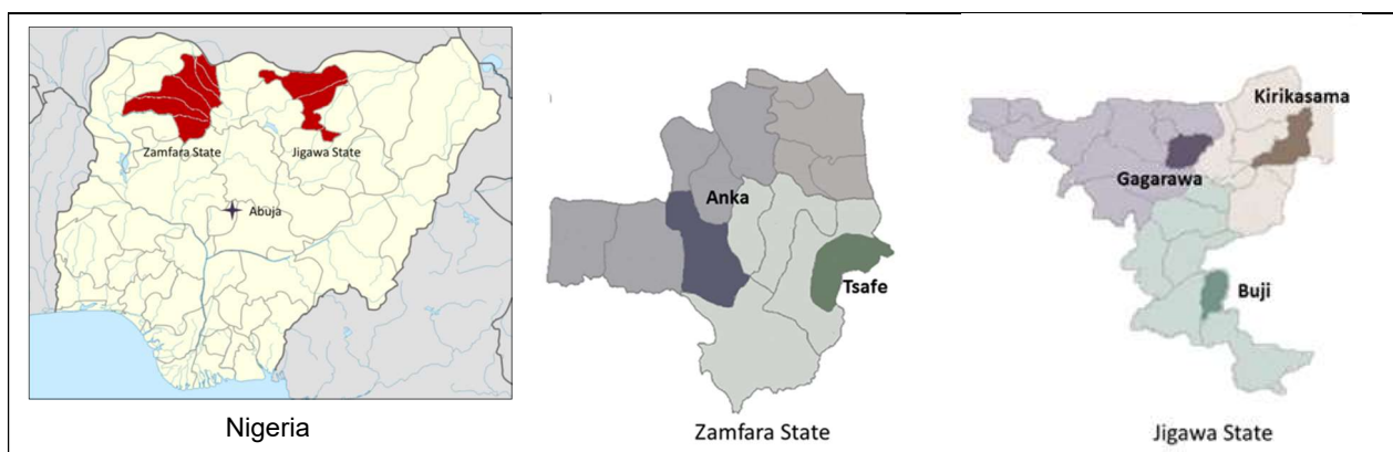
Figure 1: Location of the CDGP states and LGAs