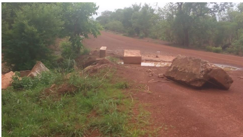
Figure 6: Broken culvert on Nabari-Jadema road, financed under a government project