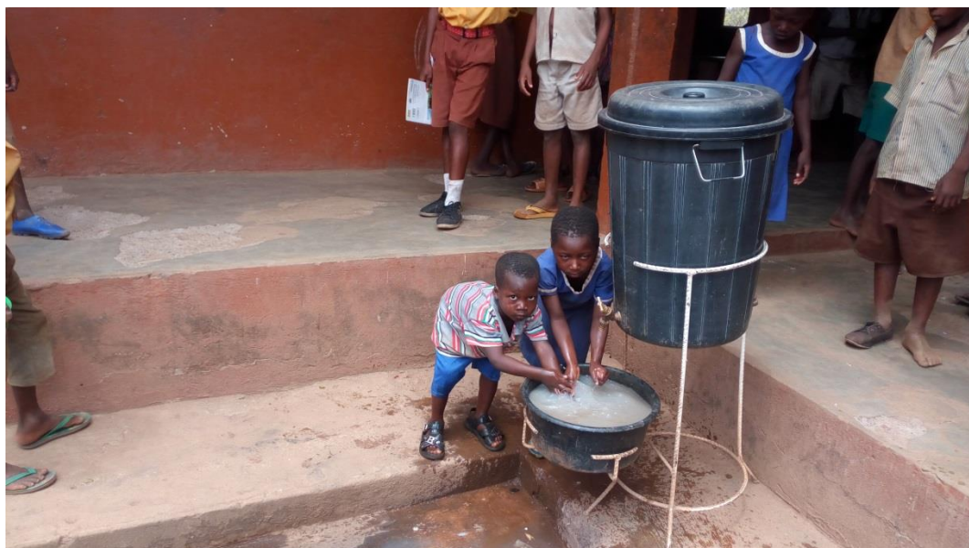
Figure 3: Veronica bucket being used wrongly by children