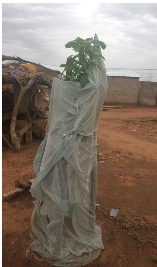
Figure 4: Bed net used to protect mango seedling