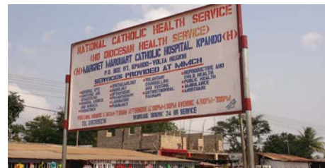
© Kpando Medical Clinical 141.

➤ To find out more about these projects, please visit: www.itad.com/projects/first-and-second-independent-evaluation-of-unaid