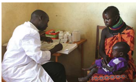
Improving health clinics to prevent future nutrition emergencies.

➤ To find more about this project visit www.itad.com/projects/5-year-evaluation-of-global-health-initiative-unitaid