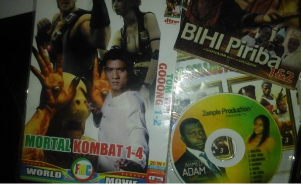
Big change from 2015: TV watching every evening, with neighbours crammed in (left); many DVDs purchased for nightly TV watching (right). Both photos from A1 (project).