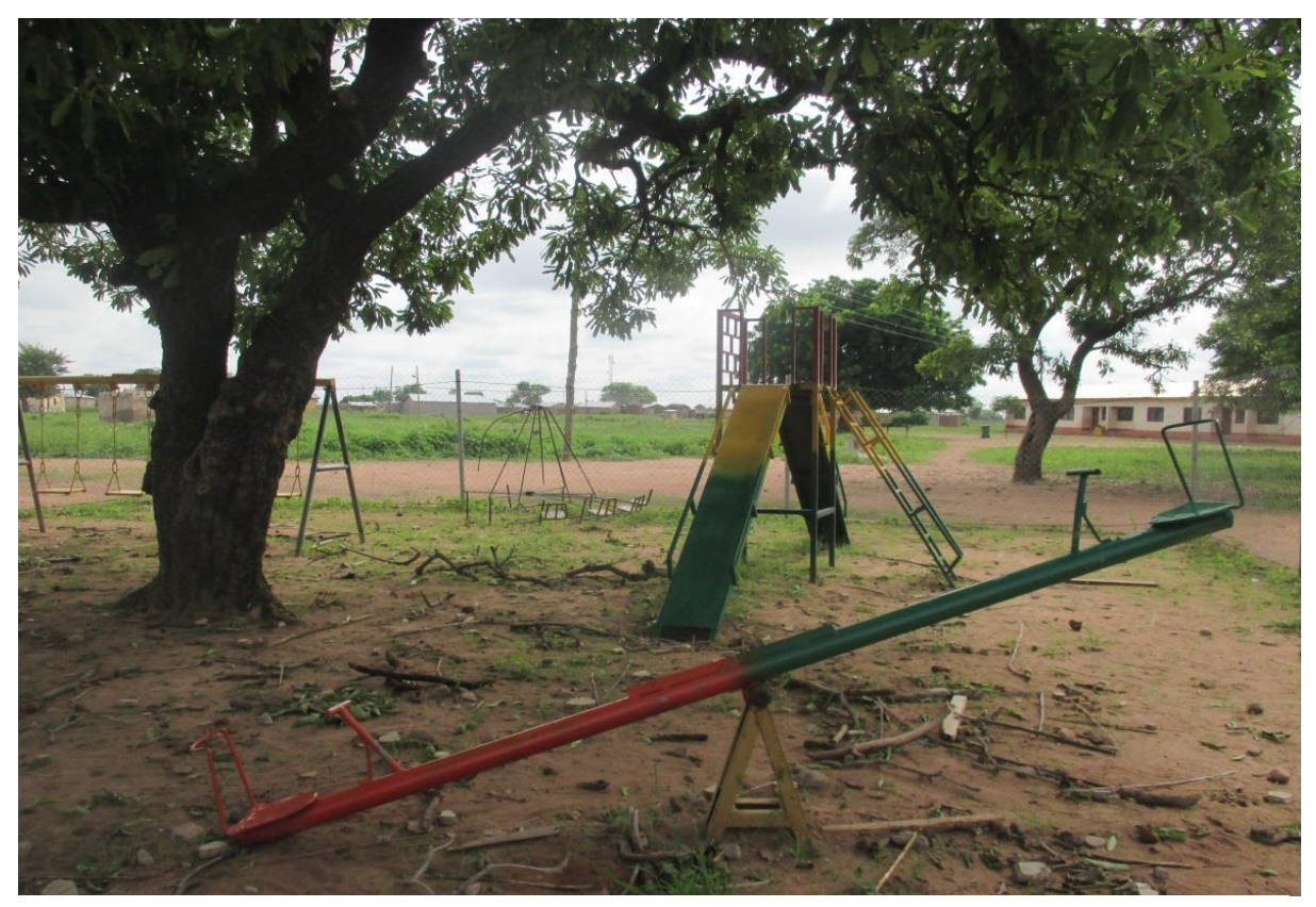
The play equipment, like in other villages, was placed under a fruit tree for shade- but the wisdom of this is questioned when the play area becomes unusable because people throw sticks and stones to bring down, in this case, shea nuts. Also in this photo can be seen broken equipment which was never removed from the enclosed area (A1 project).

All the play equipment (swings, see-saws, slides) provided through MVP at primary schools in project villages which we had observed to be in poor condition in 2015 has been fenced, people tell us using the schools' Capitation grants. Our observations indicate that this had been a requirement across all schools) with such play areas. People explained that the broken equipment had often resulted from unsupervised use and older children using out of school time (nobody suggested the equipment might not have been well made). Fencing was not completely successful as fences had been breached but had also limited access excessively in some cases. So, for example, the play area is not used at all in one school, is used only 'for one hour on a Friday' in others. Old (and hazardous) play equipment had not been removed from these enclosures in some places. Siting these play areas under fruit trees, especially shea nut and mango, had been a mistake, people shared, as people throw stones and sticks to dislodge the fruit and climb the fences to retrieve the fallen fruit.