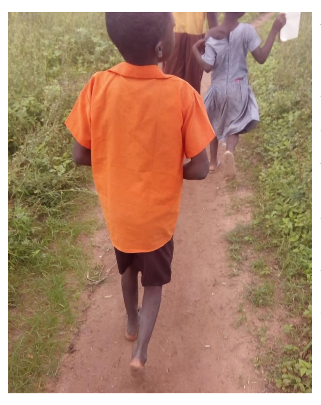
Going to school in a wet uniform as he only has one set.