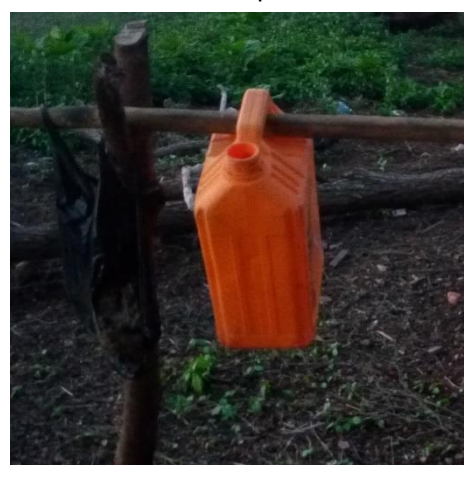
An NGO has introduced tippy tanks (above) for handwashing at the A3 (comparison) primary school. They were empty and nobody was using (above).

Use of new school toilets (built by MVP and, in comparison areas, with money from the Global Education Partnership project (GPEG) World Vision or Catholic Relief Services) was rare and primary and Junior High School (JHS) students were observed popping out of classes to pee and poo in the long grass or behind trees in all study areas. We visited school toilet blocks and found them to be largely unused although in B3 (project) the new toilets were used for poo and were smelly but here there was no hand washing facility. In B1 (project) there was evidence of use of the new six seater toilet for poo but the doors had come off their hinges and the rainwater poly tank beside the toilet had no water despite being the rainy season. NGOs have recently built toilets in the primary school in one comparison area (A3) including special facilities for girls to be able to change sanitary pads but the children told us they 'like using the bush' or go home. Here, people told us 'donors say they don't want any faeces in the community' and felt that it was odd that all these new toilets were being constructed when the teachers quarters were uninhabitable.