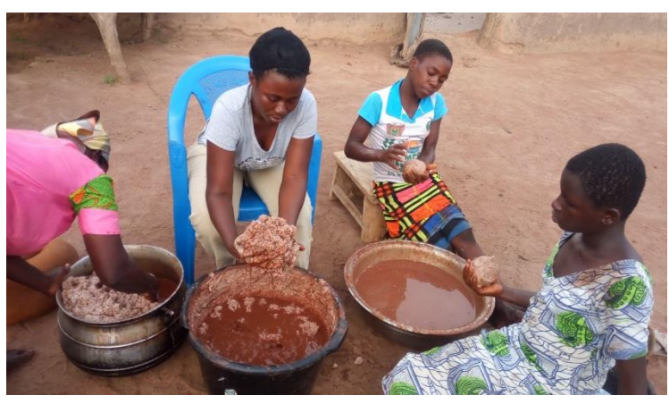
RCA researchers immersed in 'their' households, chatting while engaging in chores.

RCA team members engaged all members of the family as well as neighbours in conversations and accompanied them to fields, market, health visits, water collection and assisted with household chores in order to minimise disruption in their daily routine and to ensure the most relaxed conditions for conversations. The RCA team members also interacted with local power holders (Chiefs, Unit Committee members, Assembly members) as well as local service providers (health workers, traditional birth attendants (TBAs), mill operators, school teachers, religious leaders, shop and market stall owners, community volunteers) through informal conversations. Areas for conversations were developed collaboratively with the team to focus on people's perceptions of change (see Annex 4).