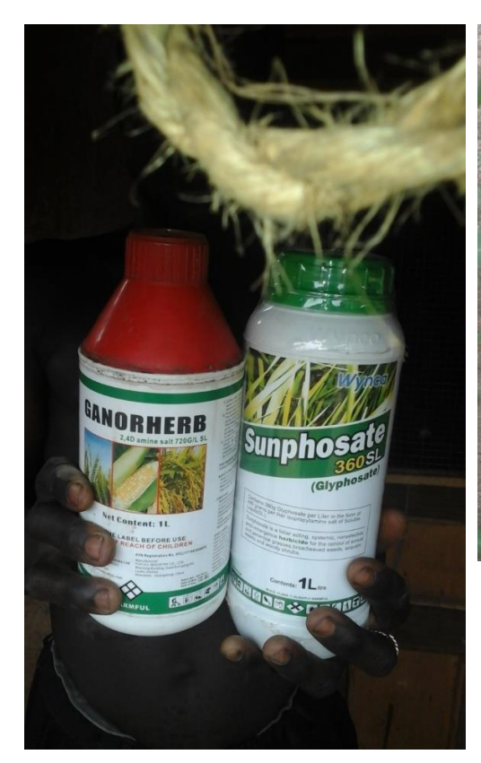
Everyone uses agro-chemicals now (A3 comparison)