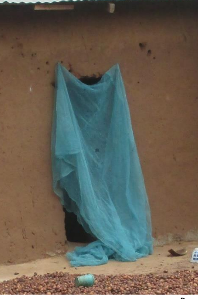
4 December 2017 Itad