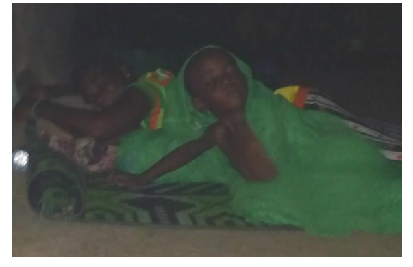
People find it difficult to reconcile the night heat and using bednets. This small boy was wrapped in the net to sleep outside but got too hot.)