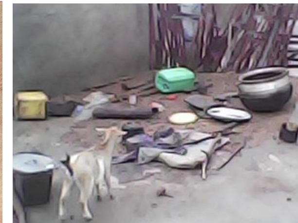
Household hygiene and, in particular, baby hygiene practices have not changed in project or comparison households. Utensils and drinking containers get left on the floor and licked by goats, sheep, cats and dogs.