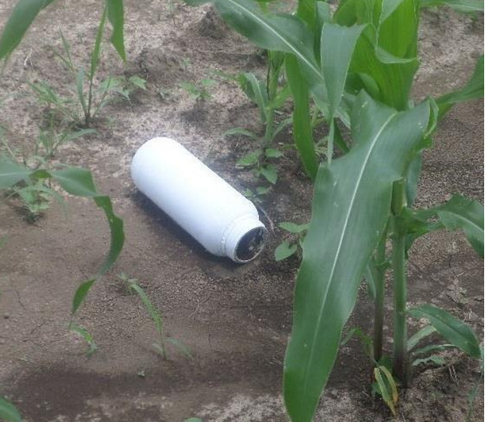
Indiscriminate disposal of agro-chemical containers (B1 project)