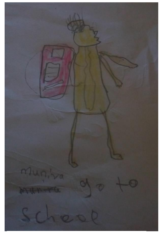
This drawing is by a 13-year-old girl in Primary class 4 and illustrates weak education outcomes (B3 project).

The school in the 'near' comparison (B2b) was founded through community initiative in 2013 and was not fully recognised by Government while the school in 'far' comparison (A3) was formerly run by an NGO and was in a very bad state as it transitioned to Government status at that time. Neither comparison primary schools had feeding programmes when we visited in 2013 and 2015 and still do not. The school in B2b (about 140 students) has never had a problem with enrolment and attendance and the teachers recommend a feeding programme only because the children 'are tired by mid-day because they come without breakfast' (primary school head) and not as a means to attract students.